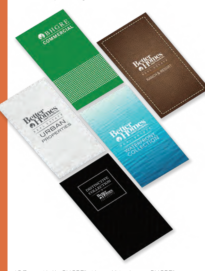
*Offer provided by BHGRE® with no additional cost to BHGRE® affiliated agents. Offer must be redeemed within 30 days of each listing going live.

BHGRE® is a leading lifestyle brand in real estate. We understand that people are seeking a lifestyle as much as they are seeking a home. We are proud to offer the most comprehensive suite of listing programs in the industry to help you offer more personalized service to your clients, no matter what type of listing you are representing.